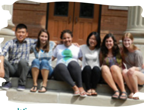
Winona House Volunteers