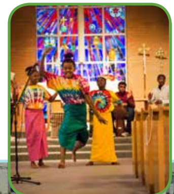
Spirit of Peace Lutheran Church

“I CREDIT WHERE I AM COMPLETELY TO LVC. IT HELPED ME FIND OUT WHO I AM AS A PERSON AND HELPED DEFINE MY PURPOSE FOR WHAT I WANTED TO DO IN MY LIFE— I KNEW I WANTED TO HELP BUT DIDN'T KNOW WHAT I'D DO AFTER COLLEGE.”