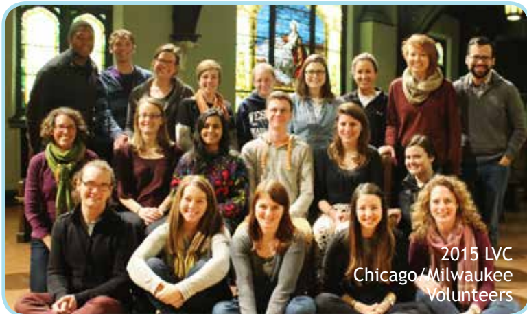
2015 LVC Chicago/Milwaukee Volunteers

in purchasing its Volunteer house in Milwaukee, WI, the Dorothy Day House. It is fitting that LVC's Milwaukee house honors the founder of the Catholic Worker Movement—a pacifist organization that continues to combine direct aid for the poor and homeless with nonviolent direct action on their behalf.