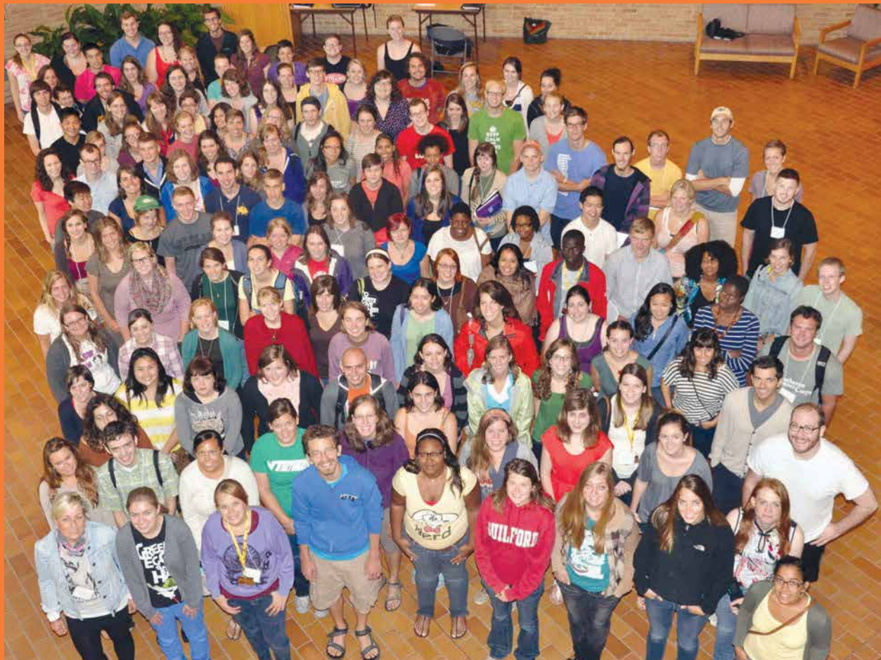
2013 Program Year Participants

LVC is affiliated with the Evangelical Lutheran Church in America, and is a member of Lutheran Services in America and Catholic Volunteer Network.