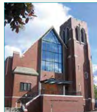
Ballard First Lutheran Seattle, WA Supporting Congregation Supports Ubuntu House Has been donating to LVC for eight years