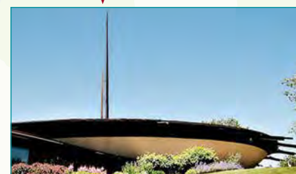
Mount Pleasant Lutheran Church Racine, WI Supporting Congregation Has been donating to LVC for 19 years