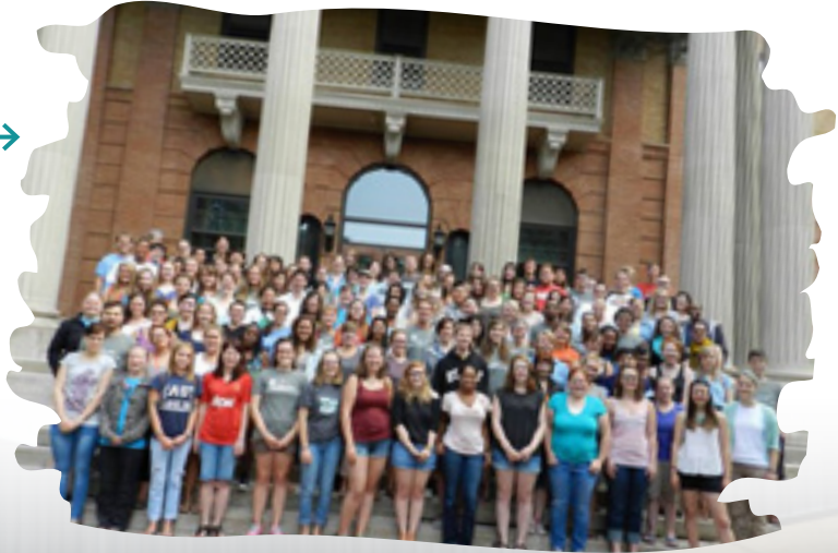
2015 LVC → Volunteers