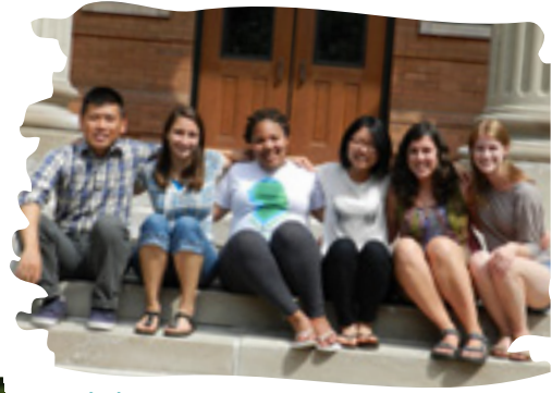
Winona House Volunteers