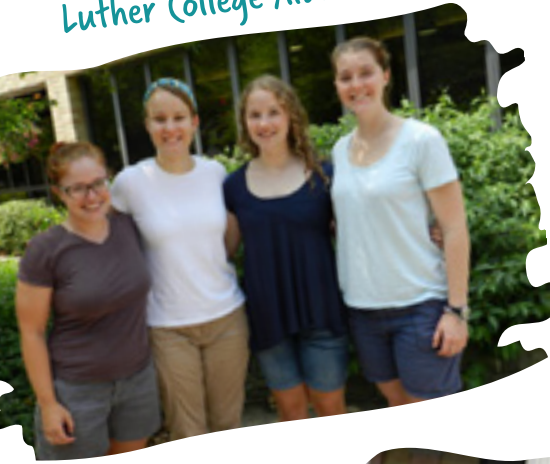
Luther College Alumni